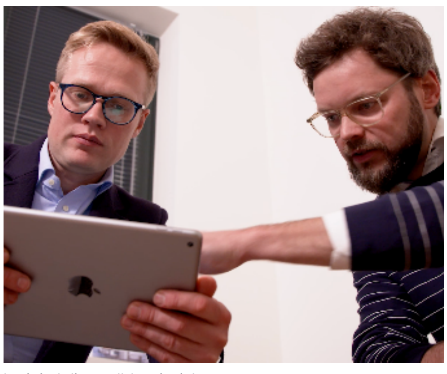
leogistics believes collaboration is key to success in optimizing the supply chain

"We live in an event-driven environment where everything is a resource that has to be moved from location," he says. "Logistics is still seen by many as a cost driver. That will change. In the future, logistics will be a competitive differentiator at every step of the supply chain. We're seeing it now on the consumer side with Amazon. They deliver fast and within a defined time-frame. That's all about location."