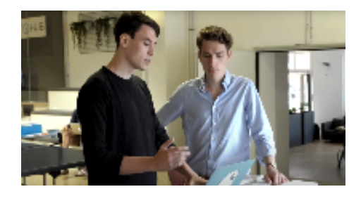
Case study Learn how HERE helped Berlin startup FreightHub attract customers