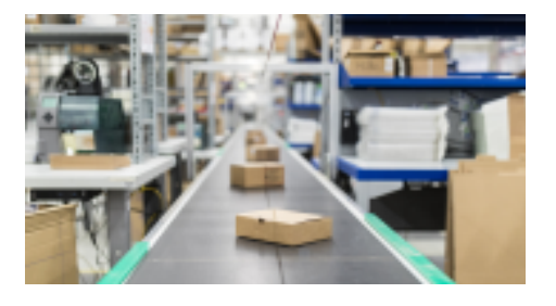
See how HERE helps you optimize your supply chain